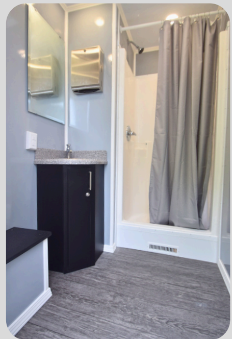
Grey Silk Interior

Curb Weight: 5,620lbs Axles: Single Box Length: 12.5-Foot Box Width: 100-Inches Opt. Fresh Tank: 150/200 Gallons Waste Tank: 350 Gallons