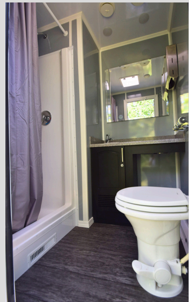
Grey Silk Interior

Designed for easy transport and setup, the SWT152 features dual-side entry doors, tandem axles for stability, and stabilizer jacks for secure use. Its anti-slip rubber flooring ensures safety, making it ideal for events, job sites, or emergency placements.