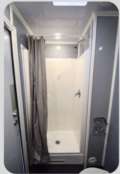
Grey Silk Interior

The SWT184 Four-Station Combo Trailer offers private rooms, each with a toilet, sink, and shower, making it a versatile choice for both washing and restroom needs. With rooms on both sides of the trailer, it's ideal for settings where either showers or restrooms are required, providing an all-in-one solution.