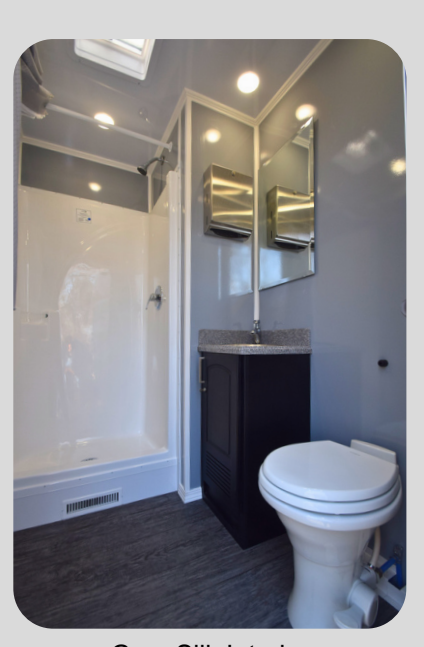
Grey Silk Interior

Curb Weight: 5,920lbs Axles: Single Box Length: 14-Feet Box Width: 100-Inches Opt. Fresh Tank:150/200 Gallons Waste Tank: 350 Gallons